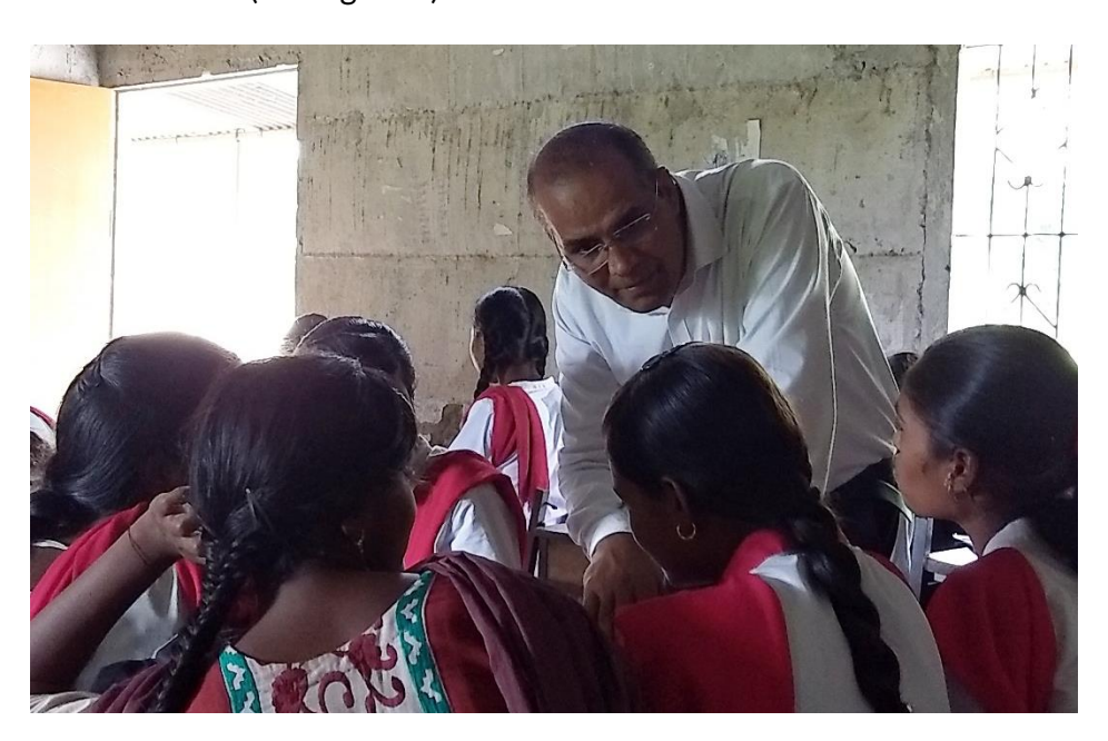
Figure 1. Providing support to struggling learners.

In class, one of the methods I use is to make groups. For example there are both semi-English medium students (who study some subjects in the curriculum in English) and Marathi-medium students in some classes. So there are students who are stronger in English and others who are weaker. Sometimes I mix them, but sometimes I assign a more challenging tasks to the stronger students to develop their writing and reading skills. I ask that group to read a story, write about it and then they should present in the classroom. The other, weaker students can listen and learn from this. But while they are working on this task, I can provide more personal support to the weaker students in the class (see Figure 1).