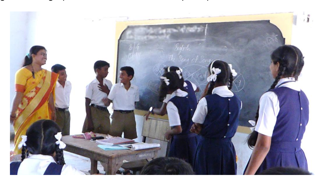
Figure 1. Students play 'Slap the board' to revise vocabulary.

A lesson becomes interesting when it has some fun elements and language games cannot be any exception to this. I often incorporate them into my lessons as ice-breaking activities at the beginning of the academic year. After I have taught vocabulary, I use language games for revising it. Whether it's practising grammar concepts, assessing the learnt content, or utilizing learners' spare time, language games are of great help. Along with acquiring knowledge, learners find the lessons enjoyable. 'Back to the board' and 'Slap the board' (see Figure 1) are two such popular games among my learners which have been adapted by other teachers as well.