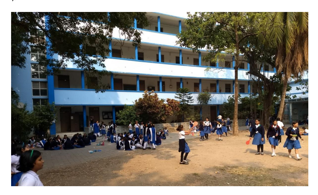
Figure 1. Greenery in the school playground.

more than a century, boasts a number of high achieving alumni spread across the globe. Currently there are twelve hundred students from grade 1 to grade 12 and three media of instructions. From grade 1 to 10 learning takes place in two media – Bangla and Urdu. In grade 11 and 12 we have English medium too. The school was established in 1911 by one of the greatest visionaries, Roquiah Sakhawat Hossein, whose mission of spreading education for women emancipation made her a great educationist of the world. The school, though located in the heart of Kolkata, is unique for its greenery on a nice sprawling campus including a small playground (see Figure 1).