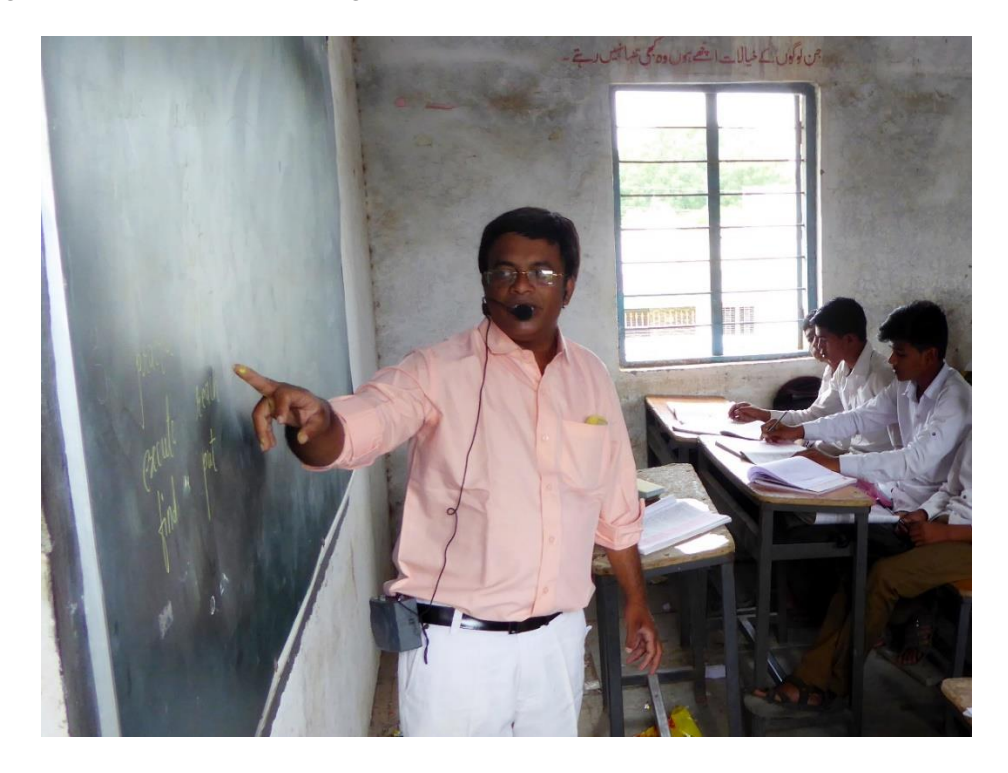
Figure 1. Wearing a collar microphone to reduce voice strain in a large class.

While teaching in Section A (the highest stream in my school) I gradually increase my usage of English. Many students here, though not able to communicate in English nonetheless understand. I am sure, if I don't give them practice in listening to English, they won't listen to it outside class anywhere. I take care of some points which need to be explained in their mother tongue, but in Sections B and C (less proficient in English) I use 90% mother tongue.