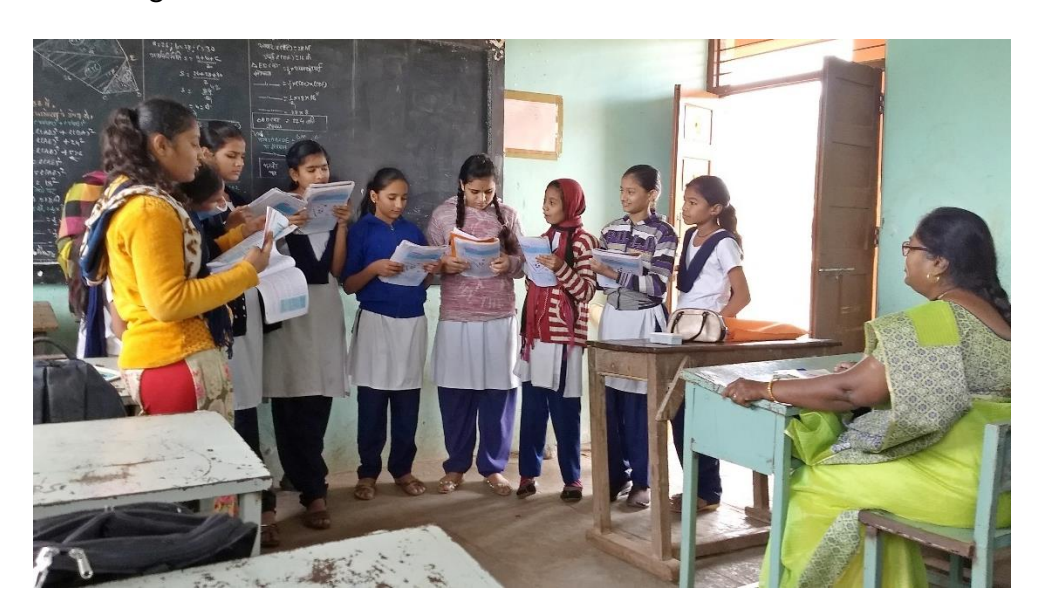
Figure 1. Chain reading develops basic literacy and pronunciation skills.

I wrote what they were saying in English on the blackboard. I then asked them to read it aloud in English and write it in their notebooks.