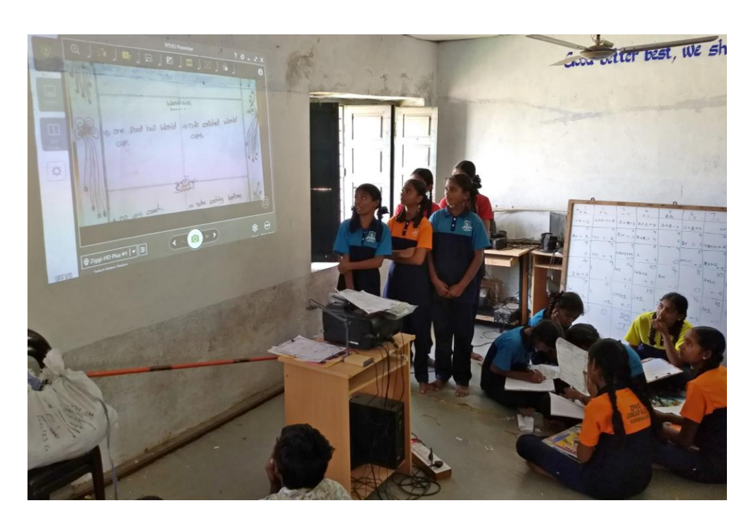
Figure 2. Students presenting to the class using simple (hand-written) 'slides'.

I divide the class into 6 to 8 groups depending on class strength (size). Each group consists of 5 to 8 students. Due to time constraints I do it once at the beginning of the year and ask them to work in the same group throughout the year. At the end of each lesson, after post-reading activities, I ask them to sit in groups to discuss their individual work. After discussion they will update whatever they have written and plan their class presentations. Each group will come to the front and read out whatever they have written to the whole class (see Figure 2). This presentation will help the students; those who didn't understand well or never tried to answer the questions can learn by listening to, or watching their friends' presentations.