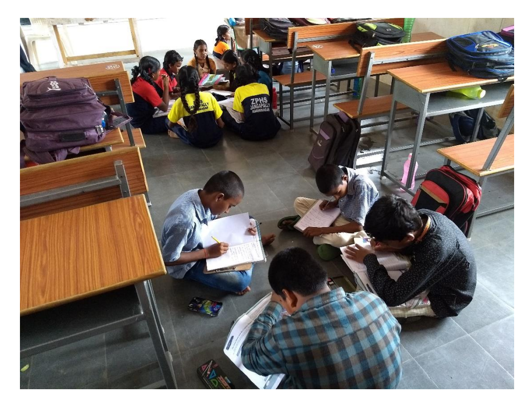
Figure 1. Students find it easier to sit on the floor when working in groups.

The third challenge is maintaining records and reports. We were asked to send different reports on quantitative data like how many of our students got 'A' grade based on gender and caste. The website repeatedly asks for the same data with different formats. This consumes a lot of time and is a distraction to classroom teaching.