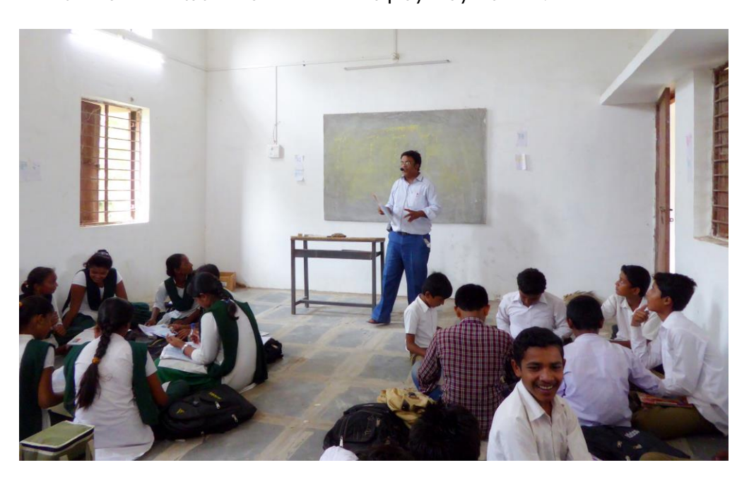
Figure 2. Groupwork can be easier in classrooms with no furniture.